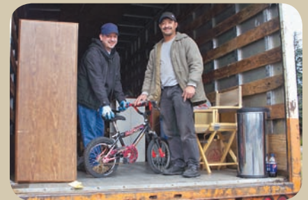
St. Vincent de Paul staff show off a bicycle that was donated at the event.