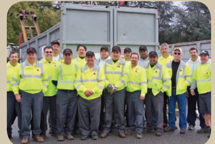
Los Altos Garbage Company Employee-Owners take a break from the action and "Say Cheese" at Cupertino's Environmental Day.